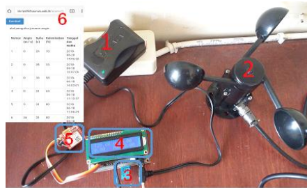
Figure 2. Wind speed monitoring tool with an anemometer, measuring temperature and humidity using DHT11 sensor and SIM800L module based on ATmega328 microcontroller

The functions of the section in Figure 4.1 are as follows.