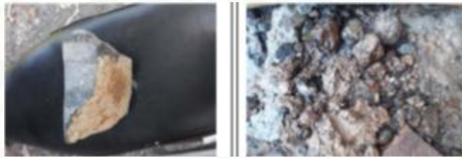
Figure 4. Example of the alluvium rock and sand on drilling

The good water starts to be discovered in depth at 12 m after penetrating a rather hard rock. This aquifer a stone fracture that is mixed with alluvium sand. The sample of the rocks and alluvium sand took during drilling can be seen in Figure 4. Unlike the soil, the layer has begun to soften, or the fractured stone has run out, the drilling is stopped at a depth at 18 m. Furthermore, the well-fitted casing with the screen of depth at 14 m down.