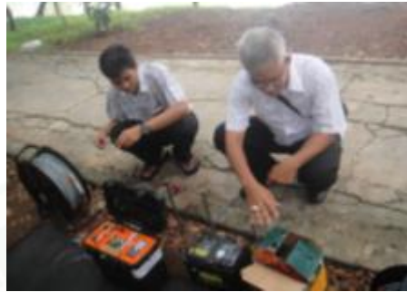
Figure 1. Geoelectric tool set