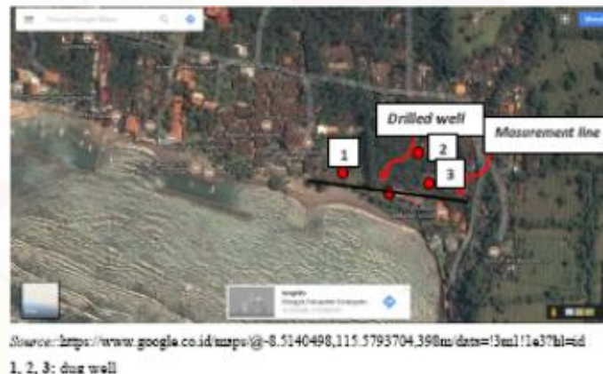
Figure 2. Research location

Candidasa is located in Karangasem Regency of Bali Province. It geographically lies in the position of approximately S = 80 30 '37,458' 'and E = 1150 34' 29,629 ' and an altitude about 12 m above mean sea level (msl). The Geologic in around Candidasa is an alluvium sandy. 6,18 Candidasa area is a developing tourist area along the beach. Many villas and hotel are under construction. The study area is located at S = 8.514300 and E = 115.580191, on the beach, wherein, it is planned to be drilled well. In the research area, there are many dug wells owned by the local residents. Three of them are shown in Figure 2 on figure research location.