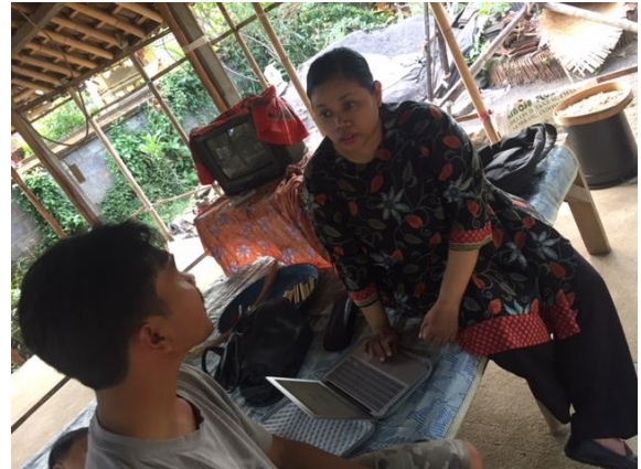
Figure 2. Introduction to the Community Service

During interview, researcher discovers that the conducted training were beneficial to craftsmen. This can be proved by their understanding and ability in using the Online Marketplace media, Tokopedia, to publish their Wood Painted Egg products.