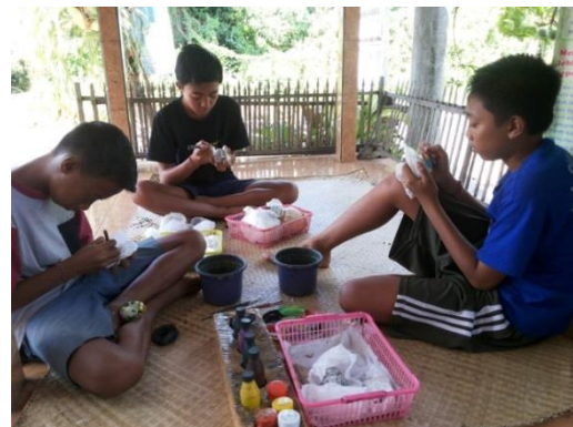
Figure 3. Wooden Egg Painting Activity