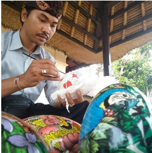
Figure 4. Wooden Egg Painting Exhibition