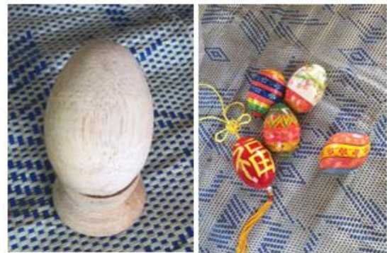
Figure 2. Raw Materials and Wood Painted Eggs Products