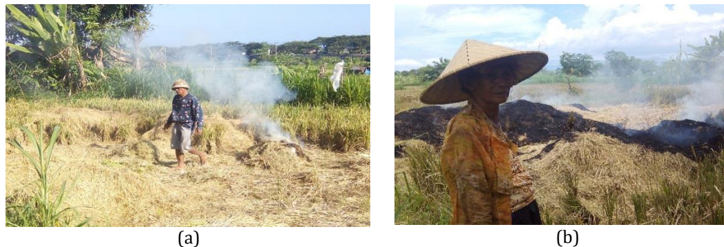
Figure 3. Burning rice straw in Klungkung Regency, (a) Location of Subak Dawan, (b) Location of Subak Sampalan Kelod

The farmers assume the ash from burning rice straw can increase the production of corn and peanuts. This view is in accordance with Ahmed et al. , (2013), viewed stated that many farmers think that combustion residues improve soil health and yields. The farmer's technical capabilities do not seem to have an impact on the decision to burn rice residues. These results have important implications for mitigation policies to reduce residual combustion (Gupta, 2010). Some photographic evidence of burning rice straw by farmers in Klungkung Regency is presented in Figure 3.