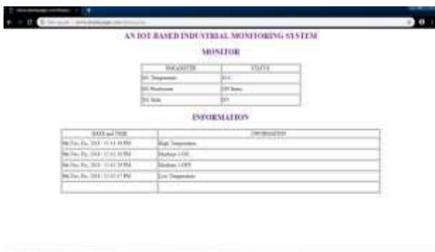
Fig.4: Monitor Screen

The Figure 3 shows login screen. An LCD consists of two glass panels, with the liquid crystal material sandwiched in between them. The inner surface of the glass plates are coated with transparent electrodes which define the character, symbols or patterns to be displayed. Polymeric layers are present in between the electrodes and the liquid crystal, which makes the liquid crystal molecules to maintain a defined orientation angle. The Figure 4 shows monitor screen. One each polariser is