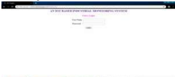
Fig.3: Login Screen