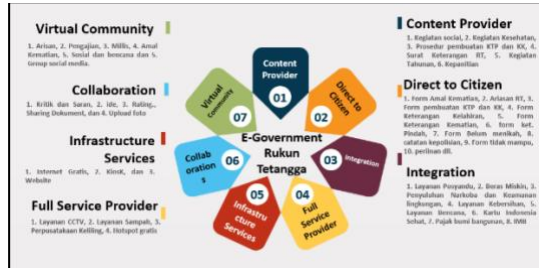
Figure 2. E-government Rukun Tetangga Model

Proposition 7: E-Government of Rukun Tetangga must have the ability of virtual community to facilitate communication among residents in neighbourhood of RT.