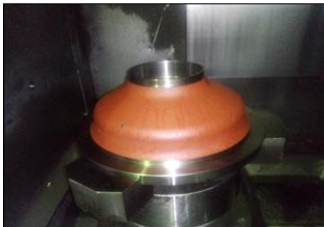
Figure 4. Experimental setup.

The results of experiments are transformed into a signal to noise ratio to measure the deviation of the performance characteristics from the desired values. In this experiment, the desired characteristic for Tool Life is larger the better. The tool used throughout the study was confirmed to ISO designation CNMG120408. A preliminary study on the tool wear behavior of the selected tool was carried out before conducting the experiment to understand the behavior of tool wear. The cutting speed 150-450 m/min, feed rate 0.1-0.45 mm/rev and depth of cut 0.25-0.45 were selected as per the cutting tool and work piece material condition. The time for each run was recorded for total tool life in terms of time. The respective Ra value also recorded for each trial which one important as per quality point of view.