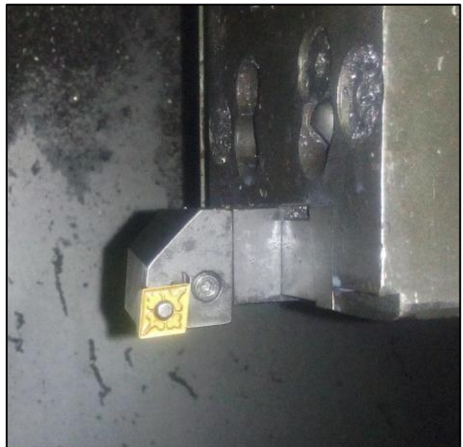
Figure 3. Cutting tool