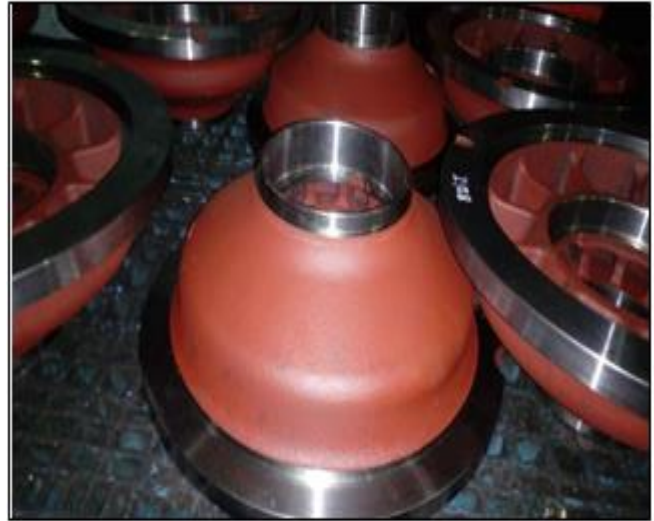
Figure 2. Work piece for experimentation

speed from 50 rpm to 2500 rpm, and a 10 KW motor drive. Generally, this type of machine used for machining of heavy and heighted parts. The insert type was CNMG120408-TM T9125 and CNMG432 TM T9125. The material used was a EN GJS-500- 7 grey cast iron. The part (370 mm in diameter and 120 mm in height) were machined under wet condition. The work material were trued, centered and cleaned by removing a 0.8 mm depth of cut from the outside surface at the time of machining. Then this setup was used for experimentation as per the designed arrays. Figure 2 shows work piece and figure 3 shows the cutting tool set as follows. The tool and work piece material combination selected as per the cost and time of machining concerned.