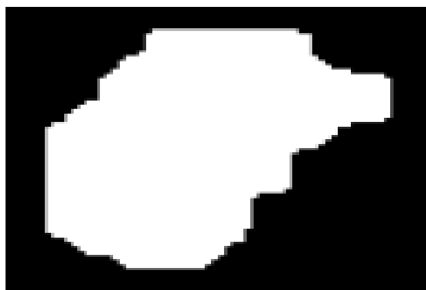
Figure.2 Segmented image

In this stage, the improved skin image is divided to isolate the tumor from the foundation (skin). Division expels the sound skin from the image and finds the district of intrigue. Generally the cancer cells stays in the image after division. Segmentation used here is Threshold Segmentation. Thresholding provides an easy and convenient way to perform the segmentation on the basis of the different intensities or colors in the foreground and background regions of an image. The input to a thresholding operation is typically a grayscale or color image. After segmentation, the output is a binary image. Segmentation is accomplished by scanning the whole image pixel by pixel and labelling each pixel as object or background according to its binarized gray level.