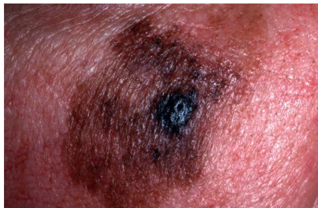
Figure.1 True image identification of skin cancer

image for skin cancer identification. The skin cancer images as a rule contain fine hairs, clamor and air bubbles. These feature that is not part of the cancer cell and would reduce the accuracy of the border detection or segmentation. The first step to do is apply some image processing techniques to the images. Thus pre-processing used to referring to remove the unwanted features on the skin and post-processing referring to enhancement to the shape of image.