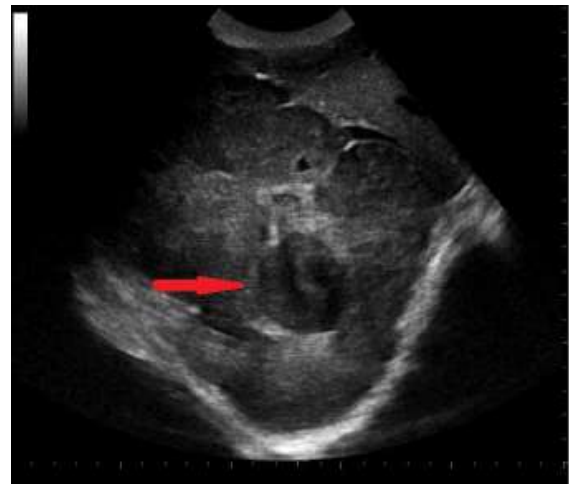
Figure: 1 Liver before detection

needed for higher interpretation. There are noise, Salt-Pepper Noise or Poisson Noise. Gaussian is additionally known as much additive noise. Images into which Salt-Pepper Noise is present, dark pixels are existing in bright areas or bright pixels are present between darkish regions. Poisson Noise is also recognized as brief noise. It is a type of digital noise. Speckle Noise is known as multiplicative noise.