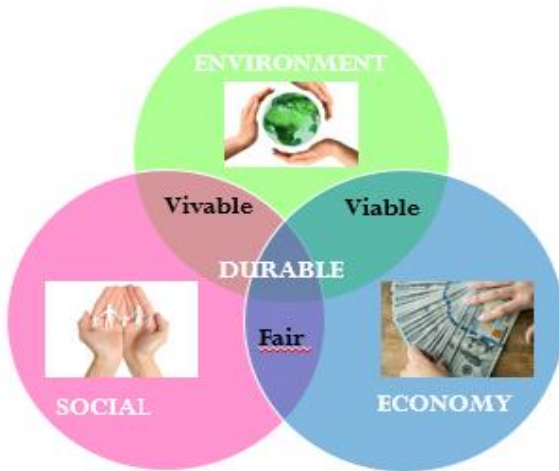
Fig.1. Three aspects of sustainable development

The three aspects of sustainable development - social development, economic development and environmental protection - are interdependent and mutually reinforcing.