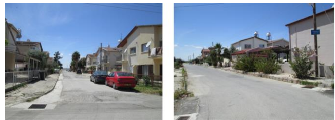
Figure 2. Inadequate greenery and lack of sidewalk, "Turan Kaynak Sitesi" April, 2015.

Most of the town inhabitants were not aware of sprawl and related impact into their daily life, most of them during interview even understand impacts of urban sprawl and this directly related to lack of awareness, still between inhabitants there are some people who willing to return into neighborhood, however some of them has reason to stay.