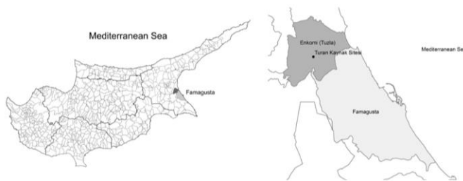
Figure 1. Cyprus Map, location of Famagusta city and "Turan Kaynak Sitesi" at proximity of Enkomi (GIS developed by author).

"Turan Kaynak Sitesi" which is one of the famous and sprawl town in Famagusta district at a proximity of "Enkomi" (Turkish: Tuzla) village at 35°09'N and 33°53'E (Figure 1), this town can be called as one of the earliest urban sprawl town in Famagusta district which is constructed in about 1994 and town had an area of 56 896 m 2 with 63 buildings which are detached, semidetached and apartment units, most of the inhabitants are affluent, they are with variety of the occupation, nation, age, gender, marital status, ethnic and etc. data collection was based on interview, observation and document analyze from the "Turan Kaynak Sitesi" as case study.