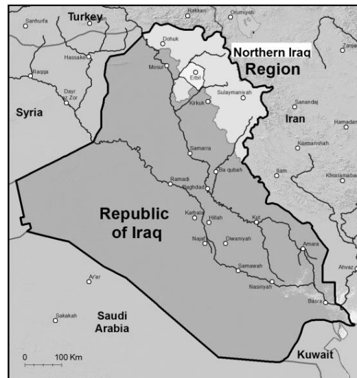
Figure 2. Northern Iraq Map

Netherlands, Bahrain, and four times the area of Lebanon. This include the governorates administered by KRG, but does not contain areas of Kurdistan outside of KRG administration, such as Kirkuk (Soderberg, and Phillips, 2015).