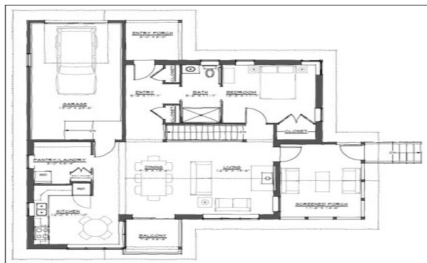
Figure 2. The Community Building, Upper Floor.

Nestled into the hillside will be 17 south-facing houses in two clusters. The lower cluster of 12 three-quarter-acre lots will comprise Phase I along Crosier Lane; Phase II the upper five-lot cluster along Stowe Farm Lane. Between the two clusters is the existing house, a large redwood home built in 1972 with five guest rooms, a large party or meeting space, kitchen, library, and workshop. This building will serve, at least for the time being, as the community house.