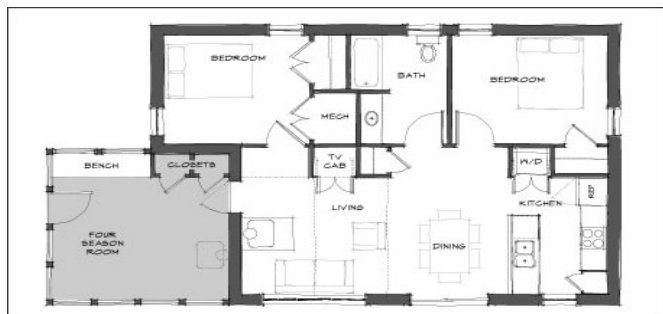
Figure 4. Mini House Floor Plan.

Second (lower floor): The lower floor has two guest bedrooms, one of which might be used for an office, and a bath. At the rear, there is a large storage and utilities room. For those who might need it, this floor could also be used as separate living space for a caregiver.