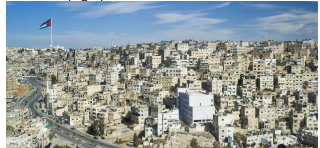
Figure 2. Homogenized Building Create an Ugly City and Lack of Sense of Place for Users (URL 1).

and more compromising life of future generation. Moreover, aesthetical characteristics are other crucial parameters in architectural design but the consideration was neglected in the built environment and constructions (Schoon, 1992). It is so clear that identity plays a significant role in civic life and individuals' culture however cities, spaces and building can't achieve sense of belonging for the users (Fig.1).