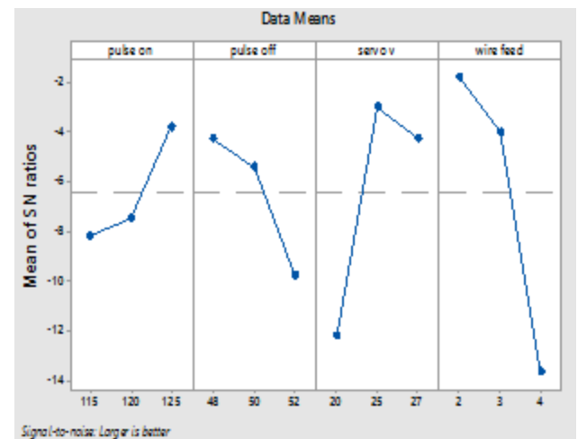
Fig. 1: Main Effects Plot for S/N Ratio of MRR