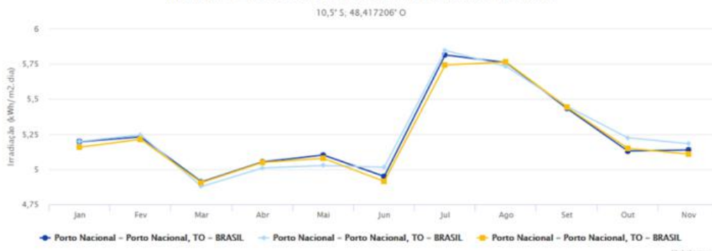
Irradiação Solar no Plano Horizontal para Localidades próximas