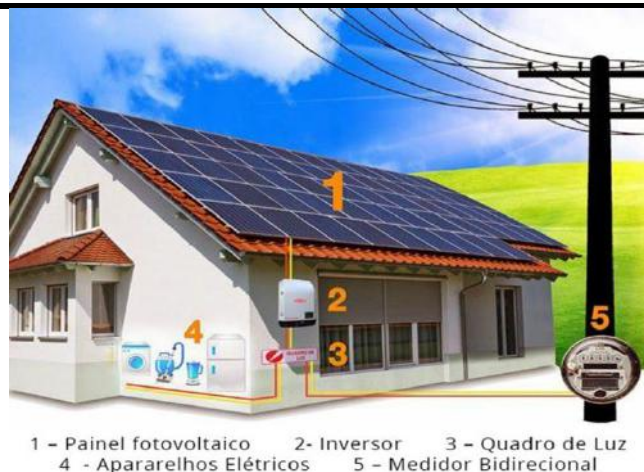
Fig. 2: Residential SFCR

The meter must be bi-directional with double operation. It must at least differentiate the active electrical energy consumed from the active electric energy injected into the network. (ANEEL, NT 0129/2012).