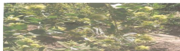
Fig 1: Flowery and fruity branches of Guiera senegalensis J.F. Gmel (Combretaceae) by Mamadou Koumaré

The fruit is an achene (Figure 1) around 3 cm long brown or green ash, spindle-shaped, hairy with sides and the remains of the calyx [11].