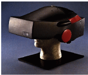
Fig 3. Head Mounted Display

• “The weapon system of Damocles” – the primary video game system accomplished in hardware, not in thought. Ivan soprano constructs a tool thought of because the 1 st Head Mounted show (HMD), with acceptable head trailing. It supported a stereo read that was updated properly in keeping with the user’s head position and orientation.