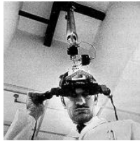
Fig 2. The Ultimate Display

• “The weapon system of Damocles” – the primary video game system accomplished in hardware, not in thought. Ivan soprano constructs a tool thought of because the 1 st Head Mounted show (HMD), with acceptable head trailing. It supported a stereo read that was updated properly in keeping with the user’s head position and orientation.