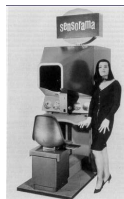
Fig 1. Sensorama

• Sensorama – The Sensorama Machine was fancied in 1957 and proprietary in 1962 underneath patent # three,050,870. jazzmanHeilig created a multi-sensory machine. A recorded film in color and stereo, was increased by binaural sound, scent, wind and vibration experiences. This was the primary approach to form a computer game system ANd it had all the options of such an atmosphere, however it had been not interactive.