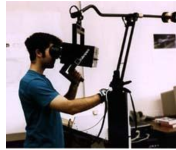
Fig 4. The BOOM

• BOOM – commercialized in 1989 by the pretend area Labs. BOOM may be a tiny box containing 2 CRT monitors which will be viewed through the attention holes. The user will grab the box, keep it by the eyes and move through the virtual world, because the mechanical arm measures the position and orientation of the box.