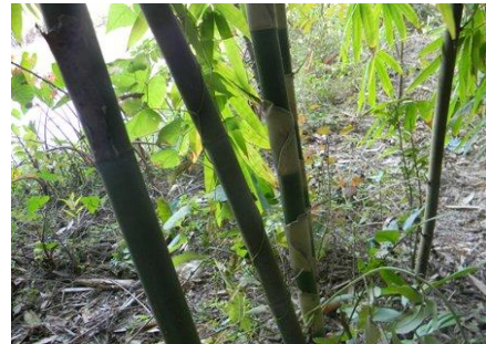
Fig.XXXIV:Moubi( M. bambusoides Trin.)