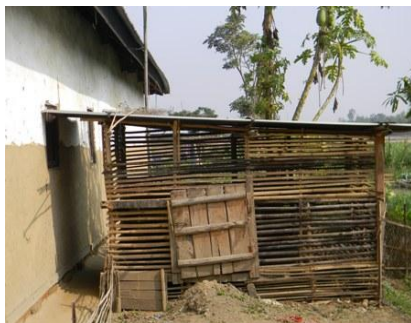
Fig.XXV: Yengol (poultry house)made by bamboo