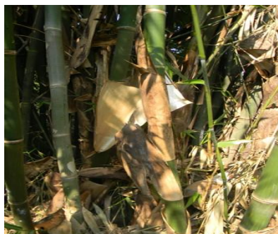
Fig. XXXV: Ui ( D. serעים Munro.)