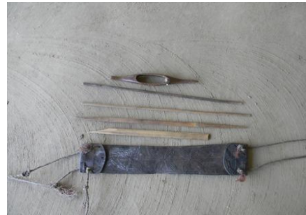
Fig.XVI: Tools of waist - loom including Pangaldem (loop like structure =muslim's invention)