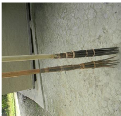
Fig XI: Long (Spear)