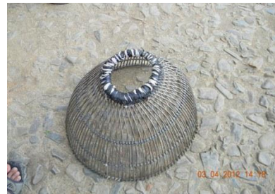
Fig.XL. Longup ( fish trap)