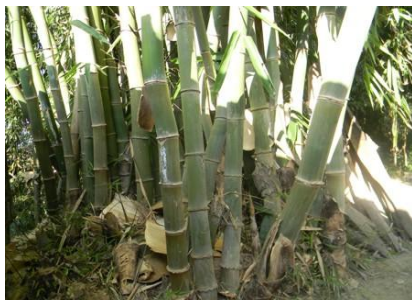
Fig. XV: Unan ( D.fimbriatus Gamble)