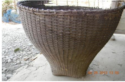
Fig.XXXI: Kapon (Cloth Basket)