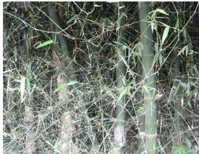
Fig.XXXIII: Saneibi ( B.tulda Roxb.)