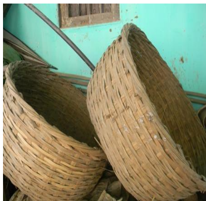
Fig III: Shajik Polang (Fodder Basket)