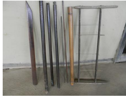
Fig. XIV: Utong (cylinder) and Nachei (thin whip)(2 nd & 3 rd from Right