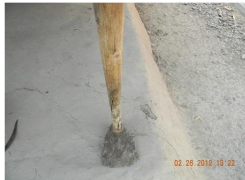
Fig.XXVI: Yotkhok (Bamboo handle of Spade)