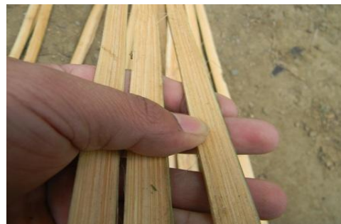
Fig.XXVIII: Paya (Thin Slice) of bamboo for making Polang (Dom Shaped Basket Fig.30) B. kingiana Gamble.