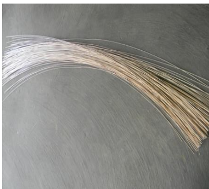
Fig.XIX: Paya (thin slice of bamboo) for making Loo (Fish trap), Fig. XX: Ootang (Bamboo)