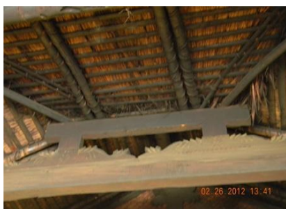
Fig. XXVII: Roofing with Bamboo