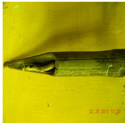
Fig II: Yathin Utong (Teeth brush Stand)