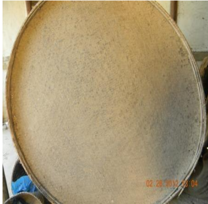
Fig.XXIII: Phoura (bigger paddy spread sheet)