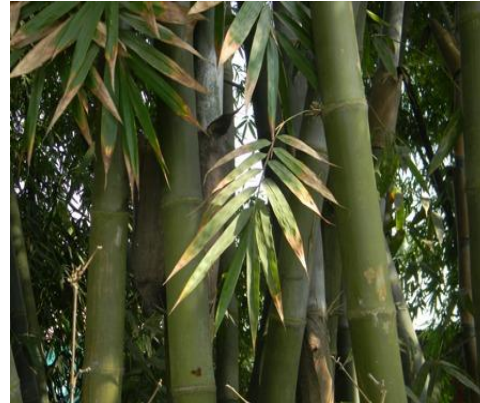
Fig.XXIV: B.kingiana Gamble ( Watangkhoh )