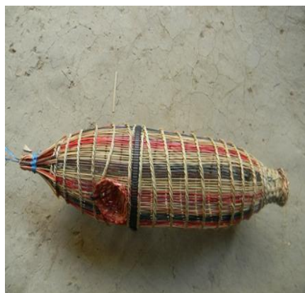
Fig IV: Loo/kaboru (Fish Trap)