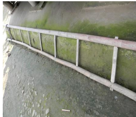
Fig.X: Keirak (Ladder )