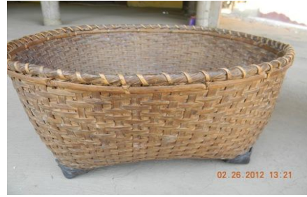
Fig.XXXII. Paddy Measuring Basket