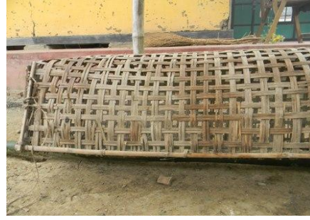
Fig XXX.: Dom Shaped Basket to house poultry