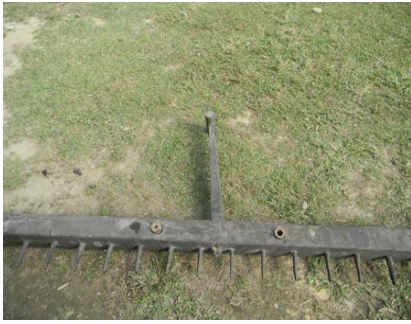
Fig. XIII: ( Ukai Shamjet ) Paddy field Laveller