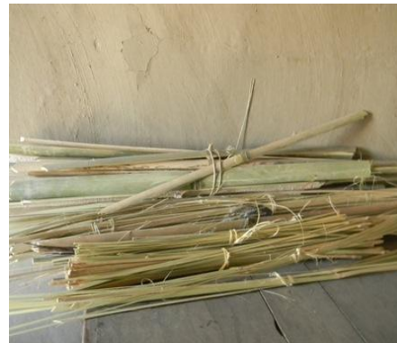
Fig. XVIII: Wachet (Slice of Bamboo)