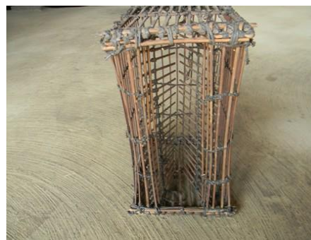
Fig XII: Taijep (Fish Trap)