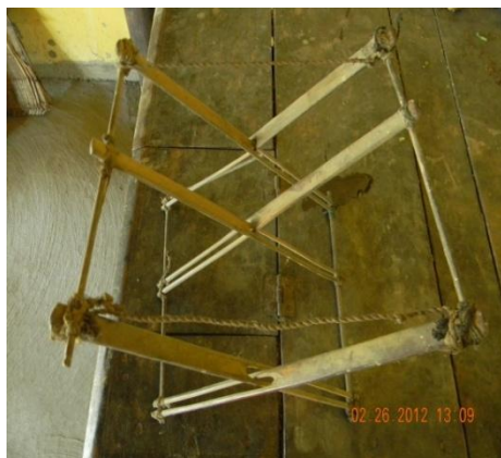
Fig I: Leihun (Book Stand)