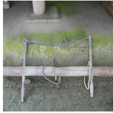
Fig VI: Popu (Cow neck Clamp for Ploughing)