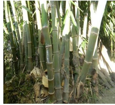
Fig.XXXVIII: Unan (D.longifimbriatus Gamble)