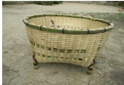
Fig.XXXIX: Yenshang Polang (vegetable's basket)