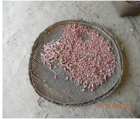
Fig. XXII: Kharai (Spread Sheet)