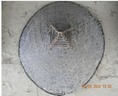
Fig VII: Shot (Pot cover)