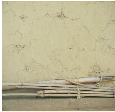
Fig XXI: Hangel ( fish net housing)