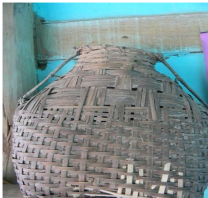
Fig. IX: Nga Tongol (Fish collection Sac)