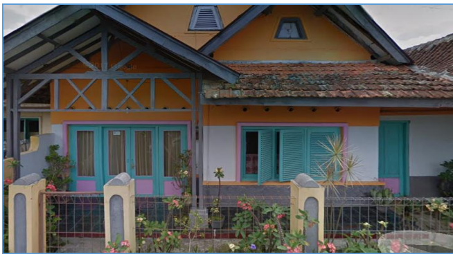
Figure 3. Mrs. Tati house wore a double window on her façade

the terrace into a closed living room which is given a barrier with outer space in the form of walls. The location of the terrace is in the front position of a house, then given the addition of the entrance and the front window (Case building Ms. Tati house, Ms. Endah, Ms. Sini, and Mrs. Erli).