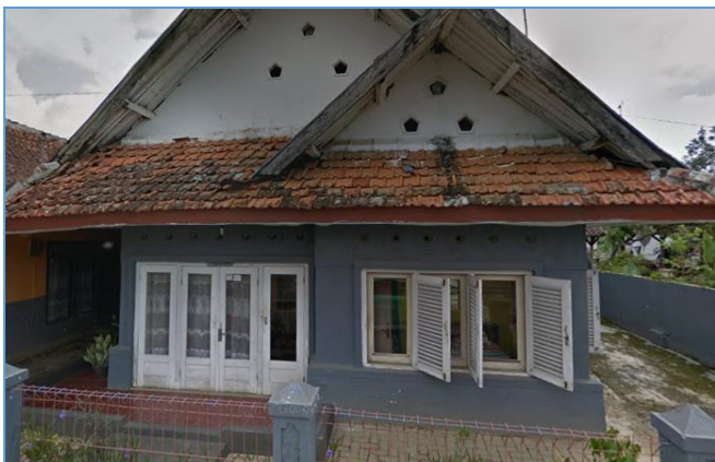
Figure 4. Mrs. Endah house wore a double window on her façade

Based on the observation of each case of building and analysis of the design of the Dutch colonial dwelling case in Ciburuy Pasantren, among others, as follows: