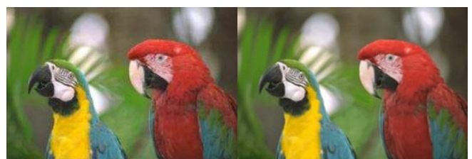
Figure 4.2 Histogram Equalisation and contrast enhancement of colour images