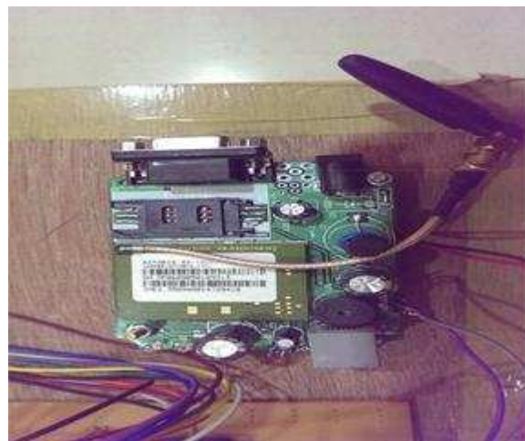
Fig 3. GSM Module