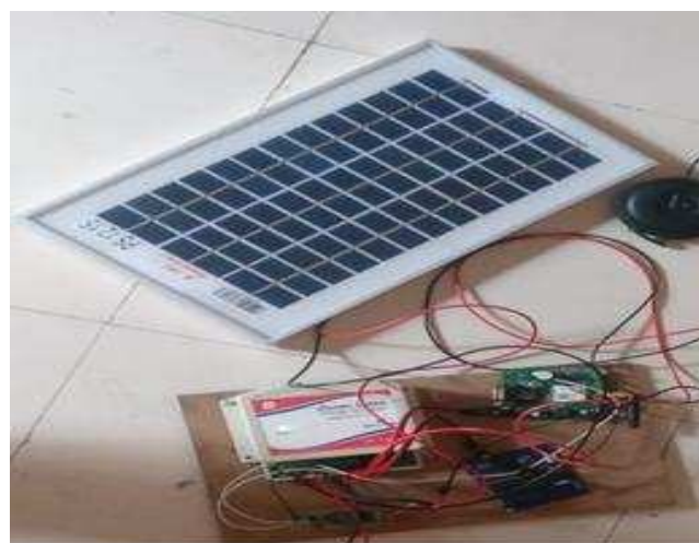
Fig 5. Prototype Design