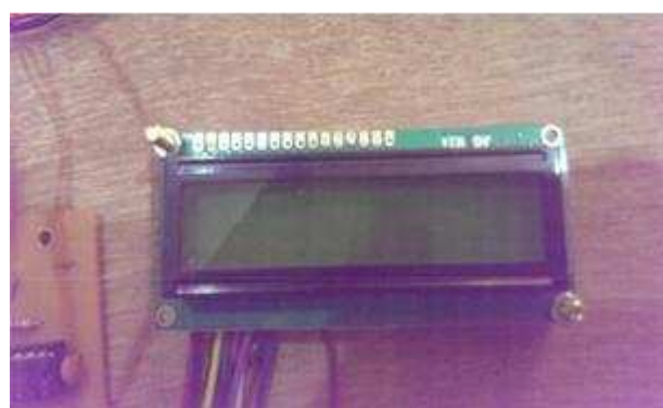
Fig 4. LCD Display