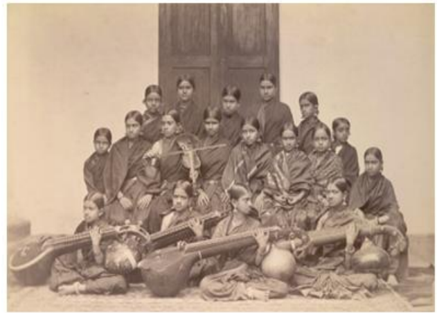
Fig 10 : Students of the Maharani college, 1890

Thus, calling Bharatanatyam as a recent terminology for the devadasi dance of Sadir holds no relevance. Bharatanatyam never ceased to exist, and never was it ever out of vogue. It always was present everywhere, except into the history texts, just like any other ancient Indian arts and sciences like the Yoga and Ayurveda, that propagated not through texts, but through the guru-shishya Parampare.