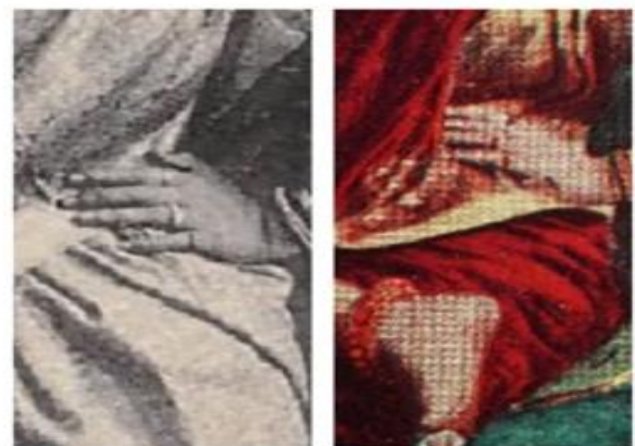
Fig 6 : Finger rings and Anklets

The expressions of confidence are unique in all the three photographs. The hair style, the position of the bindi, the ear jewelry seems to be contemporary to each other. Both the photos (Fig. 3 & 4) show the woman having longer eyebrows (Figure 1 is re-touched). The Brahman Lady has similar features with the Nautch girl, as well as Jatti Thayamma. The nose jewelry in all the three photos are exactly the same.