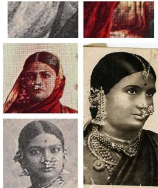
Fig 5 : Facial comparison

The above comparative figures provide the similarities of the facial characteristics, as well as the extensive jewelry of same type being worn (Figure 5).