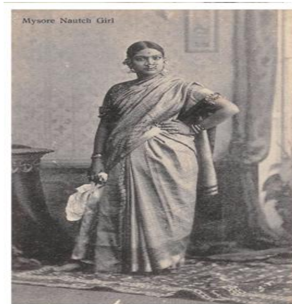
Fig 3 : Mysore Nautch Girl, approx. ~1910.