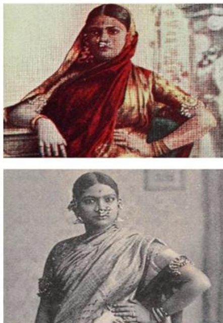
Fig 8 : Fearless Posture

The bangles, the Arm jewelry, as well as the hand dimensions seem to be exactly similar (Figure 7).