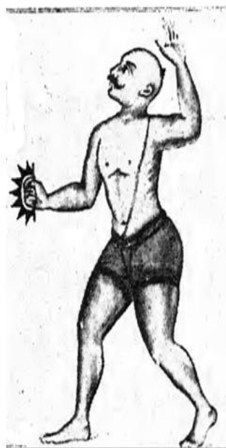
Fig 9 : A Jatti as described in the Ancient texts holding a vajramushti.

It is said that the Jatti's are the wrestler community. Some of the highlights of the Jatti community living in the region of Mysore are : They closely follow the Brahmin way of living. They have rituals exactly like the Brahmins, and one of the distinguishing similarity is that a young brahmin undergoes a Upanayana, or the Thread ceremony. They perform their Sandhyavandana after that. They shave their head and carry a 'Jutta' (pony) like a typical brahmin priest. By profession, they are kshatriyas, but by tradition, they are Brahmins. They adopt Brahmanical gotras. The attire of the Jatti women resemble that of the Brahmin women. The Jattis are high up in the social scale of castes, and without doubt are a part of the Upper class [11].