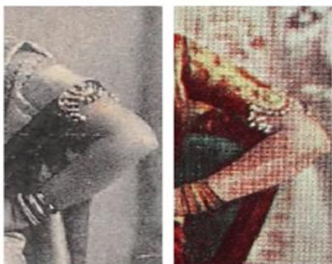
Fig 7 : Hand Jewelry

well as a brahmin woman during those times. One can also observe jewelry on the feet/fingers.