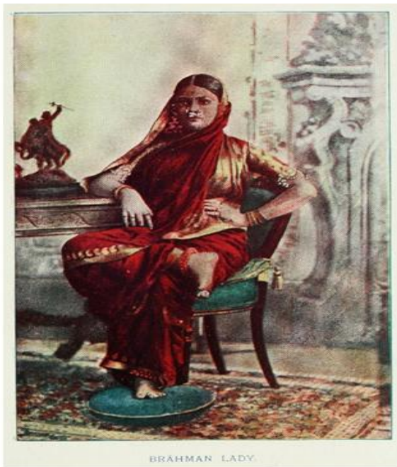
Fig 4 : Brahman Lady, by FM Coleman, 1897.

earlier photo of Jatti Thayamma in Figure No. 1 and Figure No. 3.