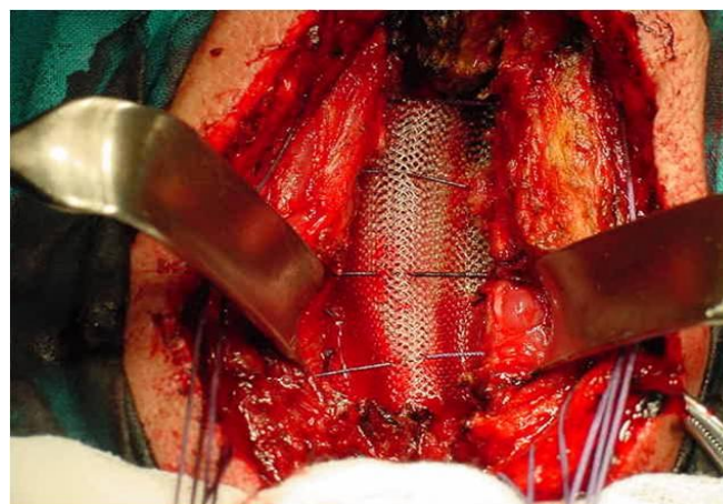
Figure 1: Intraoperative insertion of polypropylene mesh.

To simplify this procedure with more effectiveness, we conceived a cervical laminoplasty with use of polypropylene mesh (Fig.1), generally used in abdominoplasty, to provide more resistance during mechanisms of flexion-extension. Polypropylene helps reconstruction and reinforcement of the abdominal wall during surgery of inguinal and incisional hernias increasing muscular and fascial solidity.