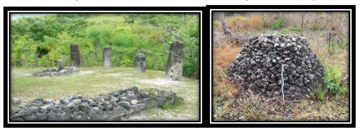
Figure 1. Pre-Islamic graves at Pambokboran and Mara'dia graves site (Majene)

The burials without containers are generally either direct or first burial, whereas the burial with containers is generally as a second burial. The grave's orientation is generally north or east-west, in various forms, i.e grave into the ground above which there is an arrangement or pile of earth or rock resembling, mountains, square or terraces of terraces, such as those on the Pambokboran site (Majene), the pile stone (Toraja and Enrekang). There are also grave surfaces in the form of tie-shaped stone bracelets (circular, oval and square), such as those found in Tinco (Soppeng), Manipi (Sinjai) and Gattarang Keke (Bantaeng). The burials into carved stones are like stone crate on site Batu Pake 'Bojeng (Sinjai) and Liangpa' (Toraja). In addition, there are also burials using wooden crates, some of which are planted into the ground such as excavation at Tallo (Makassar) and Sigeri (Pangkep) sites, and some are placed in natural caves like those found on the Tille-Tille site and Pa'tumbukang (Selayar), Bira (Bulukumba), Enrekang, Mamasa, Toraja and Kalumpang (Duli, 2012). In the Bugis-Makassar society until the 17th century still recognize the habit of erecting stone menhir (ilamung mpatue) as a sign of covenant or sign of the grave, where under the stone menhir is sometimes found the ashes or bones of humans, especially for nobels people (Pelras, 2006).