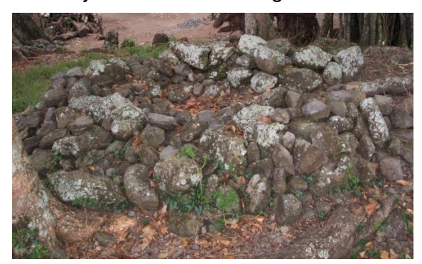
Figure 2. Temu bracelet which is estimated as a burial place on Onto site (Bantaeng) and jar as container of grave at Datu Mario site (Soppeng)