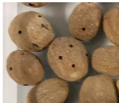
The damaged nutmeg seeds