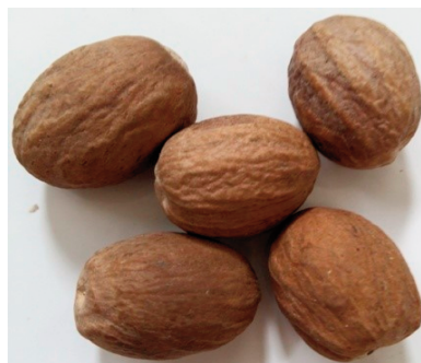
The healthy nutmeg seeds

K1 = Water content after temperature treatment