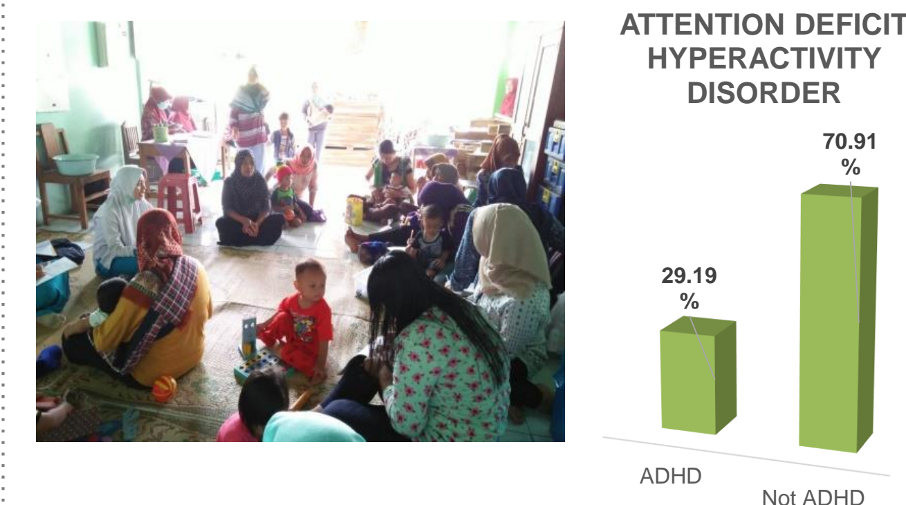
Picture 2. Distribution of ADHD

Factors associated with ADHD are heritability, central nervous system, and environmental risk factors. Of all environmental risk factors, pregnancy-related risk is the most common including tobacco smoking, prenatal substance exposure, low birth weight (LBW), and maternal distress (1,8). A previous study in Finland showed that LBW was related with higher ADHD symptoms (9). The same result shown in a Sweden study that LBW was an independent factor of all ADHD symptom forms, even after controlling genetic and environmental aspects (10).