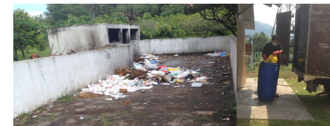
Figure 3. TPA and The Process Of Transporting Waste