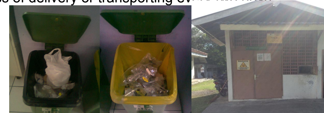
Figure 2. Storage Of Medical And Non-medical Waste

'X' Hospital does not have its own incinerator so it requires cooperation to a third party. The incinerator is used to burn medical waste. Meanwhile, for domestic waste disposal is managed by Cilegon Sanitation Department every day and 'X' hospital pay monthly levy of transport. Management of toxic hazardous waste produced by 'X' Hospital is licensed to licensed PT Limbah B3, where the process of delivery or transporting every two days.