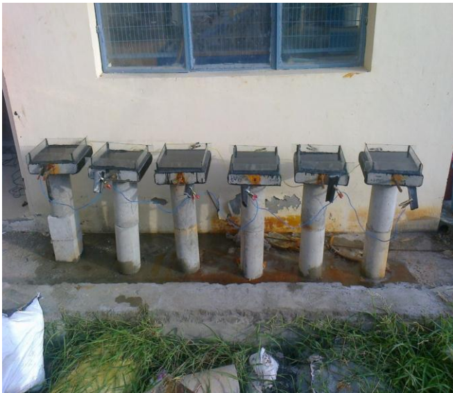
Fig. 4 Set up of slab specimens for Active Protection

To simulate corrosion damaged structures, prior to the application of wrap, an initial exposure is applied whose time of exposure was so adjusted so as to have three levels of damage viz. onset of corrosion, onset of visible crack, and 2 days after onset of visible crack are applied. After corrosion the specimens are wrapped with FRP sheets and a constant anodic current of 10 mA is supplied with CFRP sheet as anode and tendon as cathode. Specimens for Active Protection in which positive terminal are connected to the carbon fibre ribbon and the negative terminal is connected to the pre-stressing strand (Fig. 4). Corrosion monitoring is done as explained earlier using half cell potential and LPR measurements for a period of 30 days.