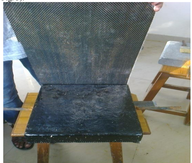
Fig. 2 Wrapping of FRP sheet after coating Epoxy paint

The samples are air dried prior to the application of FRP wraps and grinder is used for rounding off the sharp corners. Manufacturer's specifications are followed in the application of the wraps. A Wire Brush is used for roughing of slab surface so as to have proper bond between slab surface and epoxy. Conductive Epoxy in the ratio of 100:40 is used for wrapping the carbon fibre sheets onto concrete (Fig. 2 and Fig. 3).