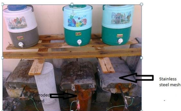
Fig. 1 Block Specimen subjected to 5% NaCl Solution

By continuously dripping with 5% NaCl solution specimens are kept fully saturated (Fig. 1). The strand is used as anode. A stainless steel (SS) mesh is rolled around 300 mm length of specimen and tied together with metal ties in order to assure electrical continuity is used as cathode. The constant voltage of 5 mV is impressed in order to accelerate corrosion