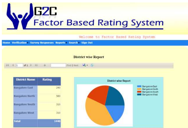
Fig 2 District wise rating report

The above Fig 1 shows Categorywise rating report. The graph shows all 9 category questionnaire types and rating. Each color in the graph indicates questionnaire categories and their corresponding rating which are received from users. As per the responses more ratings are given to general cleanliness and less ratings are given to drainage system.