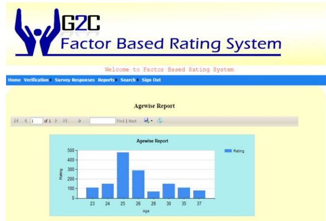
Fig 3 Age wise rating report

The above Fig 2 shows District wise rating report which are received from various bangalore zones such as bangalore east, west, north and south. Each color in the graph district names and their corresponding ratings. The table indicates total ratings given for questionnaires from various districts of bangalore.