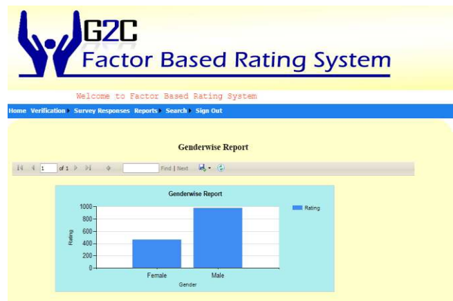
Fig 4 Gender wise rating report

The Fig 3 shows age wise rating report which are received from various age group for the given questionnaires. As per the report more ratings are received from age group 25 to 26.