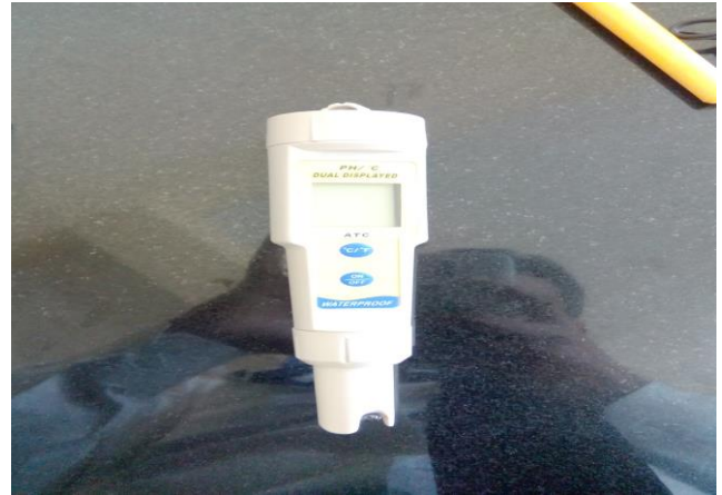
Fig.4 pH meter.

These natural resources we can use for reducing pH of water. These natural resources filled in water for some specific pH meter use to measure pH of water.