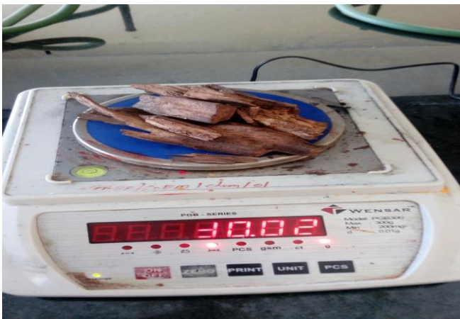
Fig.2 Driftwood which reduce pH of water.

Driftwood is available easily there so many type driftwood is available so we can use anyone but now we use shevari driftwood and observe various parameter.