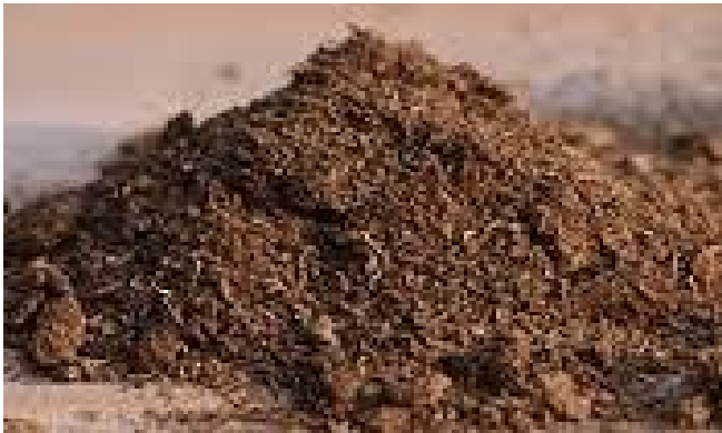
Fig.1 Peat moss which reduce pH of Water.

Peat moss :- This naturally available . but when we use peat moss due to that color of water change