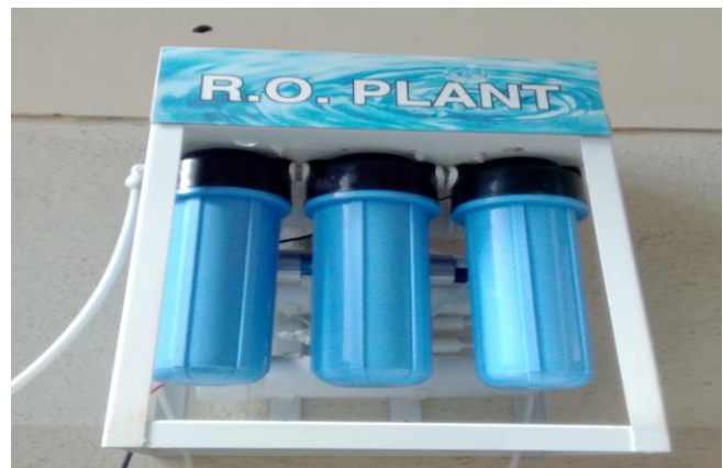
Fig.1 RO System

To evaluate various paper in which we define pH of water with respect to water and water properties. By literature survey we got when pH of water changes and that water use in pipe corrosion will reduced and parameter also changes so this concept use in specific heat transfer of water. If observe fish tank there are some material use for that pH of water is stable so like driftwood, river stone and almond leaves which stable pH of water and reduce pH of water. In power plant they reduce pH of water and then after I passes to steam production. In this experiment we dipped natural resources in water with time due to that pH of water varying. When dipped period increases pH decreasing rate also increases. Proportionally weight of natural resources adds with water and observes pH variation. In everyday we increase 10 Percentage and volume of water take constant which is 5 Liter.