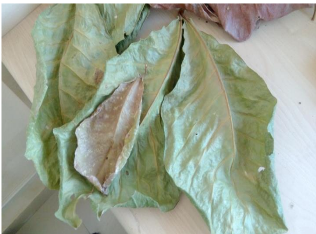
Fig. 3 Almond leaves

Almond leaves is also use for to reduce of pH of water.