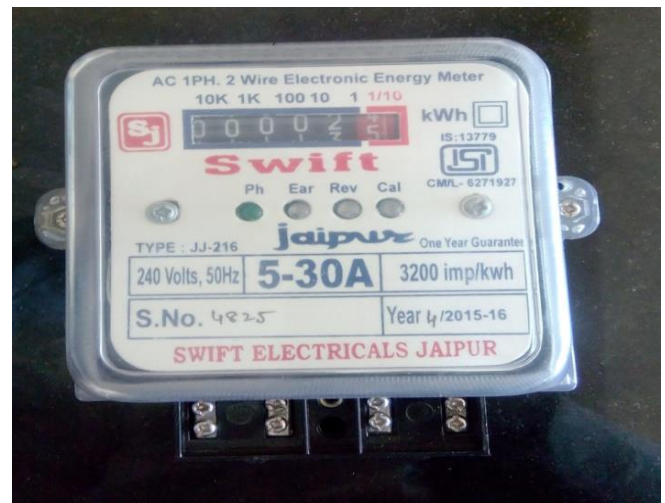
Fig. 5 Energy Meter

time and take reading after some specific time and take reading of energy meter.