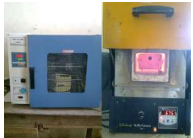
Fig. 3.Digital Electric furnace (Blast Air Oven of KX350A Model)

Other notable Equipment used for the experimental work include: a digital electric furnace called 'blast air oven' of KX350A model produced by KENXIN International Company Limited (Fig. 3); a motorized reciprocating compressor; and a spring controlled tongue.