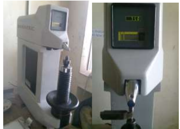
Fig. 2 Model -4150AK Digital Rockwell Hardness Testing Machine

hardness of the cutting tools vary with temperature change. The objective is to determine the permissive temperature range at which the individual cutting tool can retain its hardness before failure. The type of hardness test employed for this experimental work is Rockwell A class hardness test. This test method by application of force proved to be a major advance in the world of hardness testing. It enabled the user to perform an accurate hardness test on a variety of sized parts in just a few seconds. The type of hardness tester used for this experimental work is shown in fig. 2. The Model -4150AK digital Rockwell hardness tester is a mechanical/electrical hardness testing instrument, which comprises; digital display device, microcomputer control lift, release screw and automatic feedback lock, rotary wheels, and printer. The machine was designed to completely eliminate error and Produced in 2007 by Indentec Hardness Testing Machine Limited, West Milando, United Kingdom. For this tester, force application, indentation, hardness value display, and general operational automation methods are simplified.