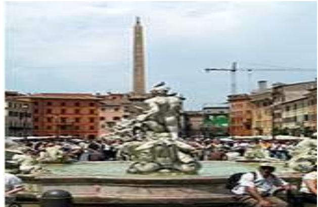
The obelisk in Piazza Navona

Others may be found at Belan, County Kildare and Dangan, County Meath. The Casteltown Folly in County Kildare is probably the best known, albeit the least Egyptian styled, of these obelisks.