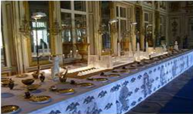
The "Egyptian" service of Sevres porcelain, designed by Dominique Vivant and given by Napoleon to Czar Alexander I in 1807, on display in the Kuskovo Palace

Egyptian revival decorative arts are a style in Western art, mainly of the early nineteenth century, in which Egyptian motifs were applied to a wide variety of Decorative arts objects.