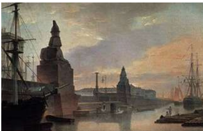
Quay in Saint Petersburg, with two sphinxes of Amenhotep III brought from Egypt in 1832

Egyptian Revival is an architectural style that uses the motifs and imagery of ancient Egypt. It is attributed generally to the public awareness of ancient Egyptian monuments generated by Napoleon's conquest of Egypt and Admiral Nelson's defeat of Napoleon at the Battle of the Nile in 1798. Napoleon took a scientific expedition with him to Egypt. Publication of the expedition's work, the Description de l'Égypte , began in 1809 and was published as a series through 1826. However, works of art and architecture (such as funerary monuments) in the Egyptian style had been made or built occasionally in Europe and the British Islands since the time of the Renaissance.