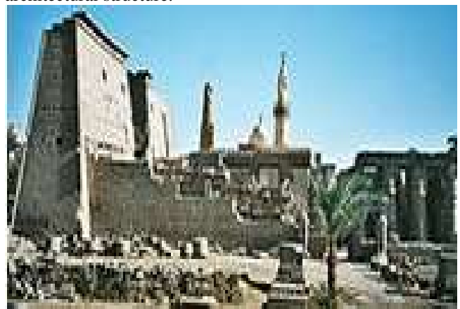
Luxor Temple, from the east bank of the Nile

The Luxor Temple is a huge ancient Egyptian temple complex located on the east bank of the River Nile in the city today known as Luxor (ancient Thebes). Construction work on the temple began during the reign of Amenhotep III in the 14th century BC. Horemheb and Tutankhamun added columns, statues, and friezes – and Akhenaten had earlier obliterated his father's cartouches and installed a shrine to the Aten – but the only major expansion effort took place under Ramesses II some 100 years after the first stones were put in place. Luxor is thus unique among the main Egyptian temple complexes in having only two pharaohs leave their mark on its architectural structure.