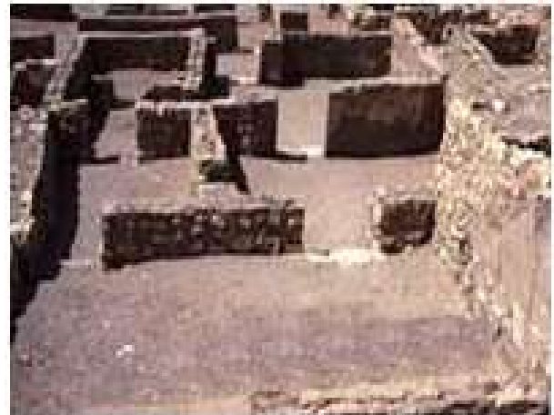
Remains of stone houses

For the most part ancient Egypt houses were constructed using materials that were handy and plentiful. This meant that the design of houses in ancient Egypt varied little, even among the wealthy. This makes it very easy to imagine what Egyptian houses look like.