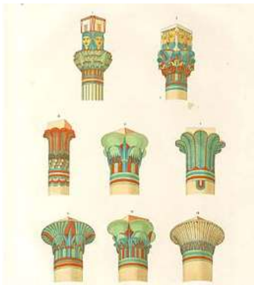
Figure shows Drawings of the types of the architectural capitals specific for the Ancient Egyptian civilization

Due to the scarcity of wood, the two predominant building materials used in ancient Egypt were sun-baked mud brick and stone, mainly limestone, but also sandstone and granite in considerable quantities. From the Old Kingdom onward, stone was generally reserved for tombs and temples, while bricks were used even for royal palaces, fortresses, the walls of temple precincts and towns, and for subsidiary buildings in temple complexes. The core of the pyramids came from stone quarried in the area already while the limestone, now eroded away, that was used to face the pyramids came from the other side of the Nile River and had to be quarried, ferried across, and cut during the dry season before they could be pulled into place on the pyramid.