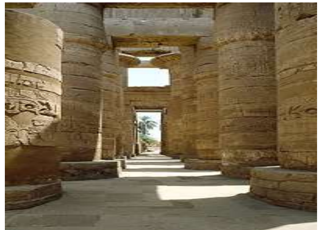
The hypostyle hall of Karnak Temple

Luxor Temple. The key difference between Karnak and most of the other temples and sites in Egypt is the length of time over which it was developed and used. Construction work began in the 16th century BC. Approximately 30 pharaohs contributed to the buildings, enabling it to reach a size, complexity and diversity not seen elsewhere.