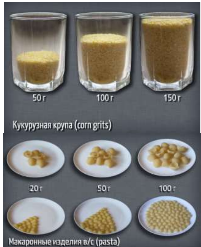
Fig. III. Example of food photography from "An album of photos of products and dishes"

When the product is chosen from the list user expose the size of one regular portion in grams or ml. To facilitate the weight characteristics of the products in the process of entering data for each product displayed images on screen (all photos copyright) of these products in full size (for a 15-inch screen) with their weight. Example of food photography from "An album of photos of products and dishes" is shown in the Fig. III.