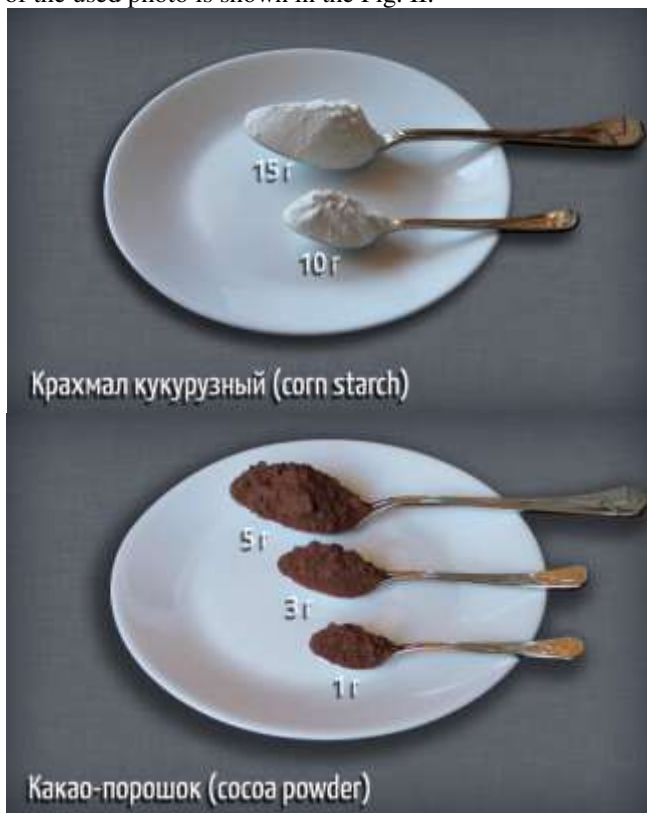
Fig. I. Example of food photography (confectionery)

In each of the groups of products contains a large number of specific products. The program is presented wide enough for an objective assessment of range of the products. Example of the used photo is shown in the Fig. II.