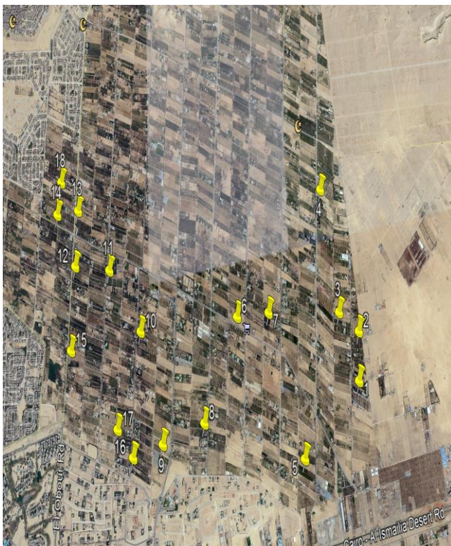
Figure 1. Map of the sampling locations