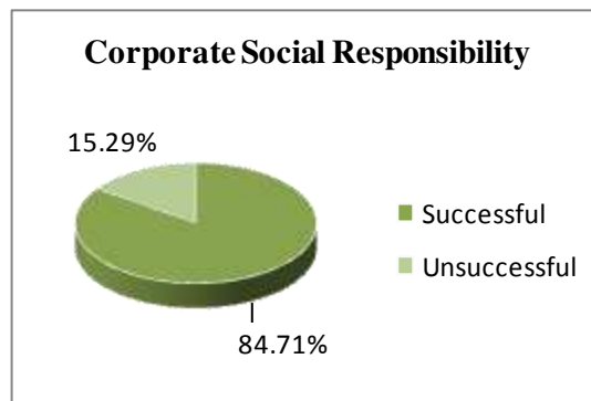
Figure 2. Corporate social responsibility

The chart pie shows that 84.71% of leaders are successful with their leadership, while 15.29% unsuccessful. The percentage shows above average, which is up to 50% showed successful, and less than 50% showed unsuccessful. The 84.71% prove that most of Leaders who work at GKPMI thinks that the servant leadership and transformational at this organization quite good enough. The 15.29% of unsuccessful prove that some of leaders think that servant leadership style is going well but transformational leadership is not quite good enough. From servant leadership, all of them show a good result. And from transformational leadership, some of leaders think that the intellectual stimulation needs to change.