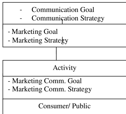
Figure 1 Marketing Communications Model (Bulaeng, 2000)

The success of a strategy depends on how the strategy should be able to adapt the resources in its power to identify any opportunities. Based on analyzes the resources owned by the company and an assessment of market opportunities, a strategy to be in position to establish operational objectives are realistic for the company, such as the model presented in Picture 2.