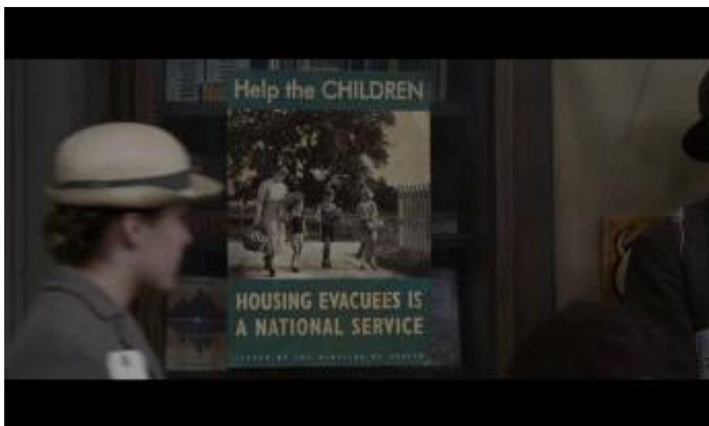
Figure 1. Pevensie sibling were being evacuated because of the war

The researcher explained about World War II which was taken as the setting of The Chronicles of Narnia: The Lion, the Witch and the Wardrobe and saw the history from the film itself. The setting took in World War II.