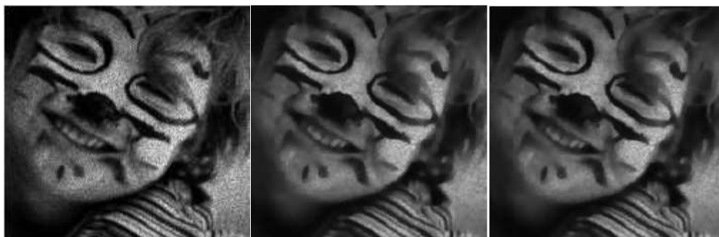
(a) Noisy Image, \sigma = 0.03