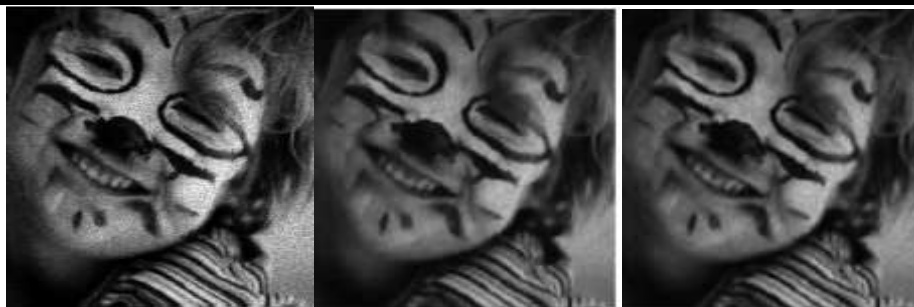
Test 1: (a) Noisy Image, \sigma = 0.03 (b) AA Method (c) Proposed Method