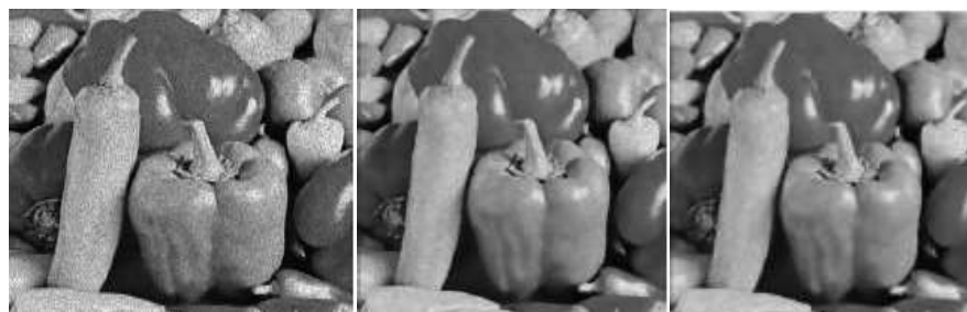
(a) Noisy Image (b) AA-Method (c) Proposed Method