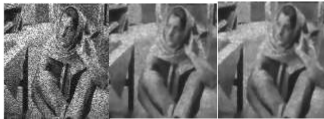
(a) Barbara, 0.1 (b) AA Method (c) Proposed Method

Fig.10: (a) Noisy Signal, \sigma^2 = 0.03 (b) Restored Signal, AA-Method, \lambda = 35 (c) Restored Signal, Proposed Method with \alpha_1 = 450, \alpha_2 = 0.0001, \alpha_3 = 650 .