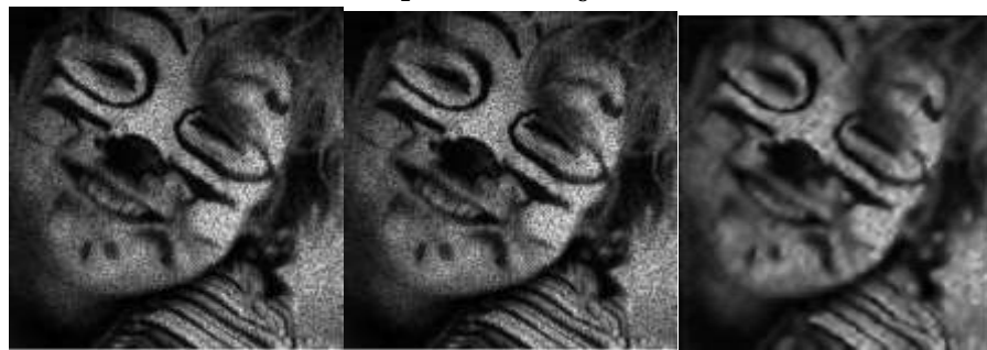
(a) Face, \sigma = 0.1 (b) AA-Method (c) Proposed Method