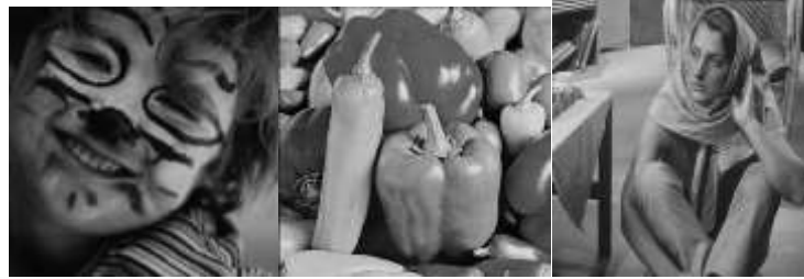
Fig. 1: Face, Peppers, Barbara