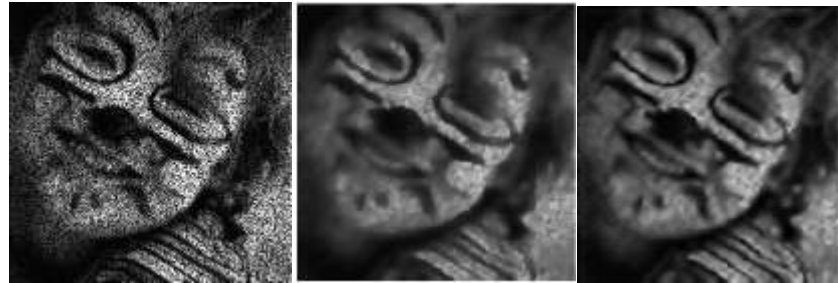
(a) Face 0.3