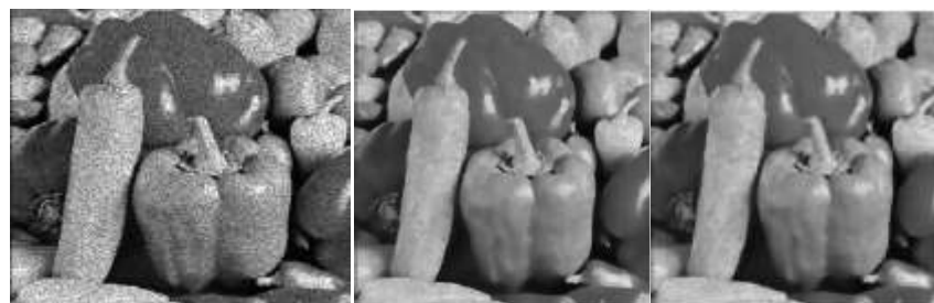
(a) Noisy Image (b) AA-Method (c) Proposed Method