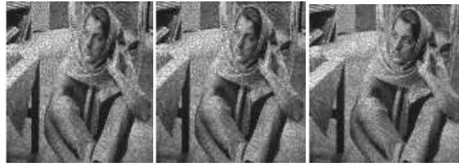
(a) Barbara, 0.03 (b) AA Method (c) Proposed Method

Fig.10: (a) Noisy Signal, \sigma^2 = 0.03 (b) Restored Signal, AA-Method, \lambda = 35 (c) Restored Signal, Proposed Method with \alpha_1 = 450, \alpha_2 = 0.0001, \alpha_3 = 650 .