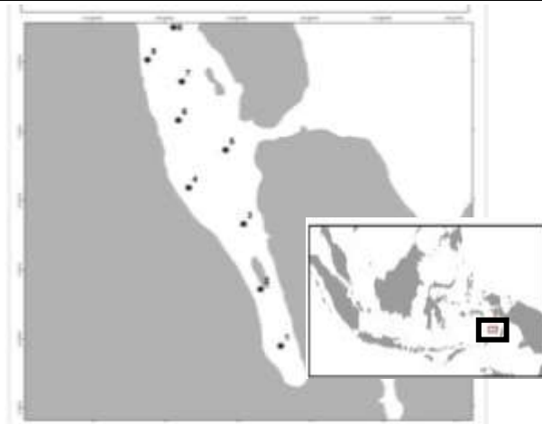
Fig.1: Study site

Pearl oyster used in the study were grouped into three size classes of shell length (Dorso Ventral, DV), i. e. 5 \pm 2 cm, 13 \pm 2 cm, and 18 \pm 2 cm. The oysters were obtained from Sathean Bay. All of the pearl oyster shell used were cleaned from the attacks organisms, the pearl oyster weight (BW, g) was measured using digital scale to the nearest 0.1 g, then the total shell length (mm), total shell width (mm), and the shell thickness (mm) was measured using caliper and ruler. Thirteen pearl oysters with size range 3 cm to 18 cm of a shell height were collected for the meat (DW, g) and shell (DW, g) dry weight analysis which was dried at 105^\circ\text{C} for 24 hours. In addition, others supporting data were also collected such as the total number of pearl oyster and number of pearl oyster per basket in the current culture, the number of baskets per long line, long line length, the distance between long line, and the growth of pearl oysters.