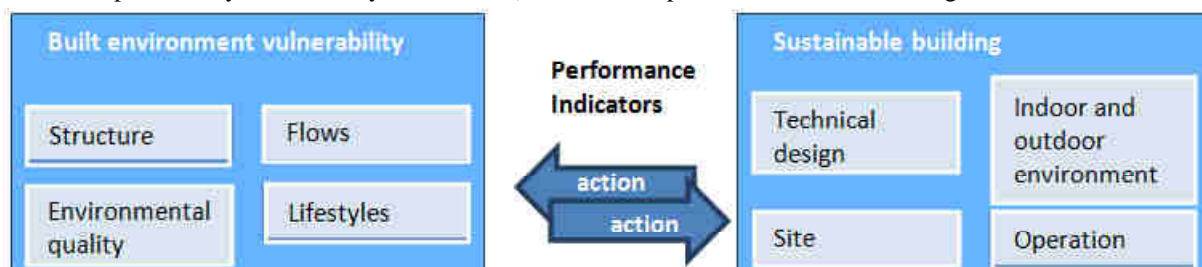
Fig.2. The integrated urban-building evaluation framework

Buildings are seen as complex systems which interact with the built environment metabolism through their performances: site, indoor and outdoor environment, operation and technical design.