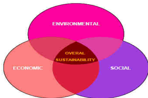
Fig.1: Three basic rings to achieve overall sustainability

and communications with some or all of the principles of sustainability for whatever reasons will need to be able to understand, manage, and communicate how their 'economic impacts', link to social and environmental outcomes. This need will be particularly marked for those organisations that have the most significant economic impacts. Sustainability does not stop at economic or environmental dimensions. To live in a society, there is a need for efficient and reliable housing, transport, energy distribution, health-care, communications and utilities. This notion of 'institutional sustainability' typically relies on a government's long term environmental and social commitment.