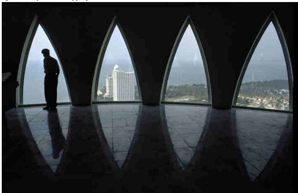
Fig.1: The quadrants are four unique, universal lenses with which to look at anything.

The quadrants are used in three key ways for sustainability: to organize sustainability information, to diagnose the challenges facing a sustainability initiative, and to prescribe an integrated solution that accounts for all the major dynamics at play. The quadrants are essentially four lenses that, when taken together, help us to comprehensively look at anyone, anything, or any event. Thus, by looking at a sustainability initiative through all of the quadrants, comprehensive picture of all the dynamics at play in planning and designing that either make or break the success of our conceived project in the built environment is identified. Each quadrant represents one of four seemingly universal perspectives. According to Barrett (2005), perspectives available to us do appear to be the perspectives which are most commonly observed and most easily replicable. The bottom line is that the quadrants reveal the interiors and exteriors of individuals and collectives in the built environment. Like unique windows on the world, the quadrants offer four unique ways of looking at sustainability planning and design, each of which reveals different dimensions and qualities.