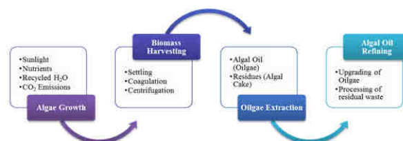
Fig. 1: Algal processing for jet fuel production

Algae are cultivated in open ponds [16] or closed photobioreactors (PBRs) [17] using Zarrouk medium [18,19]. Biomass can be collected at 21 days old and separate through centrifuge. Algae biomass is dried using solar dryers before Oilgae extraction. Algal oil can be extracted by mechanical press to yield 10%wt [20] followed by chemical solvent usually hexane to obtain all lipids according to Bligh, E.G. and Dayer, W.J. [21]. Solvent is recycled and algae waste is subjected to further processing. Oilgae biorefinery is necessary to improve its properties and confirm the jet fuel standards. This is achieved via Oilgae hydrocracking process to yield directly bio-jet fuel, or transesterification into biodiesel followed by distillation above 120°C to get the required cut and blend with petro-jet fuel [22]. Processing of algae for bio-jet fuel production is summarized in Fig. 1 [23].