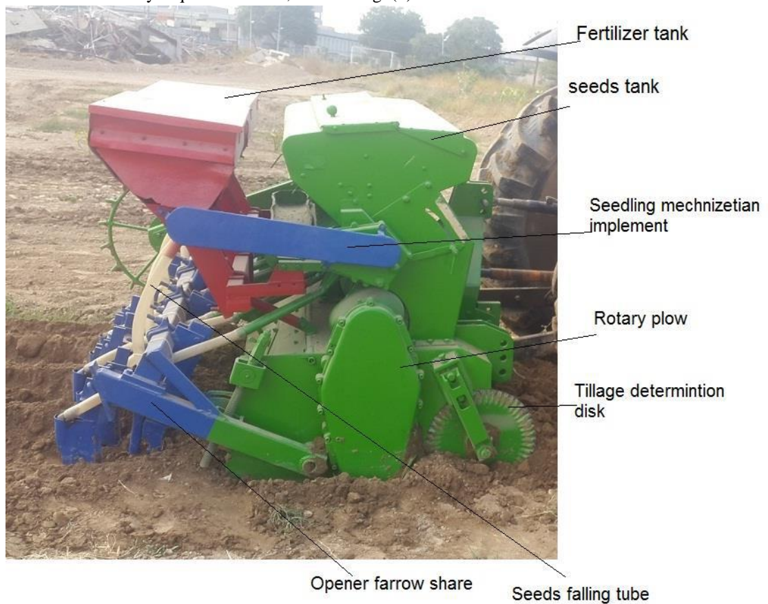
Fig.1: front view of the combine implement

This combine implement is planting the corn seeds at the top two thirds of the furrow shoulder of the corn and the process of fertilization on the bottom of the furrow plant, and this implement is characterized by the ability to seed and fertilization and control the depth of the plant and any height and have the ability to horizontal movement (Figure 1) shows the work of the machine as shown in Fig. (2)