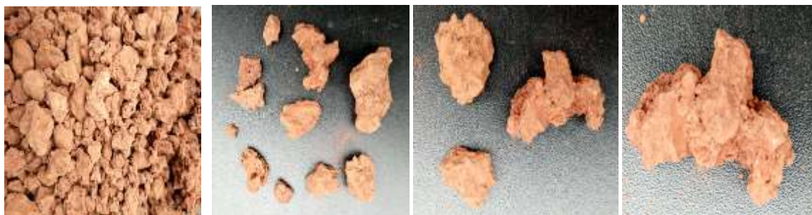
Fig.1: Red Scoria: Photo by Mekonnen Birhanie March/2016, Ethiopia

Central America, Southeast Asia (Vietnam, etc.), East Africa (Ethiopia, Kenya, etc.), and Europe (Greece, Italy, Spain, Turkey, etc.) [14,13].