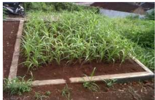
Fig.1: The lysimeters