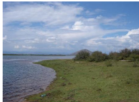
Fig.3: View of the station six Shegan situated in eastern shore line