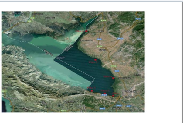
Fig.2: Coordinates of sampling points