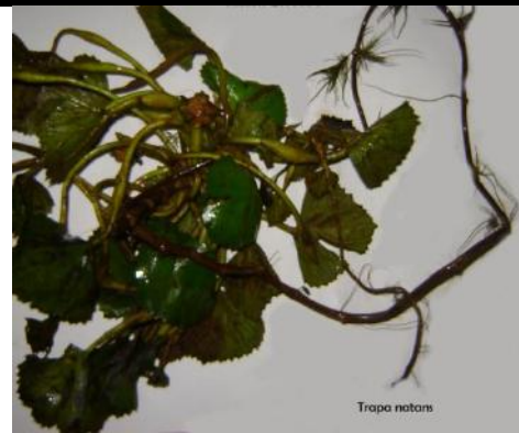
Fig.1: Trapa natans found in Skadar lake

Trapa natans is an herbaceous, floating-leaf aquatic species that often grows in water around 60 cm deep. The floating leaves are arranged in a rosette, with leathery upper leaves up to 5 cm wide and broadly rhomboid, triangular. The species also produces submerged leaves that are morphologically different. The fruit is a horned nut-like structure that develops underwater and is approximately 3cm wide. The stems of plants is flexible and from 1 to 5 m long, nodes of the stem have slender linear roots, while. The plant is anchored in the sediment by the lower roots that emerged from the propagating seed hull. Trapa natans is found world-wide in full sun and low energy, nutrient-rich fresh waters. The species is disturbance tolerant: it has been shown that sewage inputs create favorable conditions of increased alkalinity for the plant and that increased nitrogen is correlated with increased petiole and fruit biomass.[4]