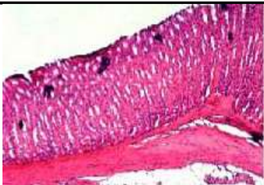
C.S. of gastric region of Control Rats