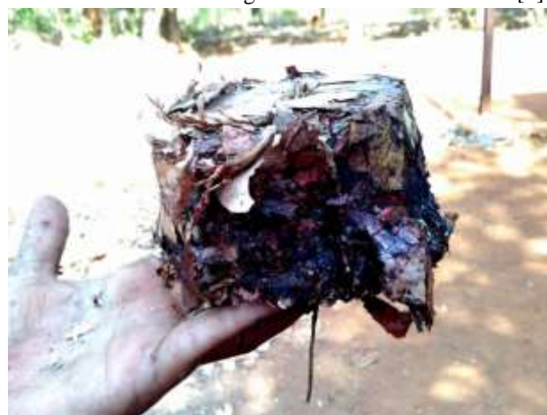
Fig. 2: Leaf Logs

For the performance evaluation, three briquette samples were made from the dry leaves for evaluation. During the process of densification, the following statistic: time for loading biomass into moulds, t_1 , sec, time for compressing the biomass, t_2 , sec, and time for ejecting the biomass briquettes, t_3 , sec, were observed and recorded following after [5][6]. The production capacity of the machine in kg/hr was also recorded. On ejection of the briquettes from the moulds, the mass and the dimensions of the briquettes were taken to determine the density in \text{g/cm}^3 . The compressed density (density immediately after compression) of the briquette was determined immediately after ejection from the moulds as the ratio of measured weight to the calculated volume [5].