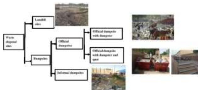
Fig.2: Different waste disposal sites (adopted from Abdourahamane et al. , 2015)

- Landfills: Last link in the waste disposal chain, these are quarries or areas adjacent to the city where the collected waste from dumpsites are eliminated. They are often very large uncontrolled dumpsites.