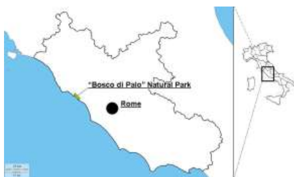
Fig. 1: The "Bosco di Palo" Natural Park.

The "Bosco di Palo" Natural Park (Figure 1) is located 37 km to the north of Rome (Central Italy - IGM Topographic Map Sheet 149 NE IV) and is situated between the sea and the Via Aurelia in locality of Palo Laziale, in the town of Ladispoli (41 ° 56 'N, 12 ° 05 'E). The study area is part of a narrow coastal plain that extends from the delta of the Tiber River and that was formed during the Quaternary period.